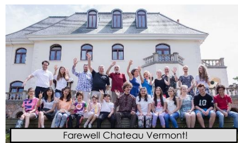
Farewell Chateau Vermont!

1100 - Coach to airport/harbour for departure, pack lunch brought along