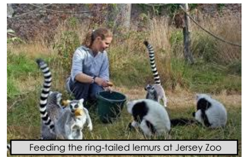
Feeding the ring-tailed lemurs at Jersey Zoo

1830 – Dinner at Chateau Vermont (Chicken curry & rice / Lemon tart)