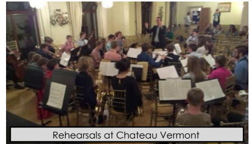
Rehearsals at Chateau Vermont

1830 – Dinner at Chateau Vermont (Jersey beef burgers with potato salad & coleslaw / Strawberry gateaux)