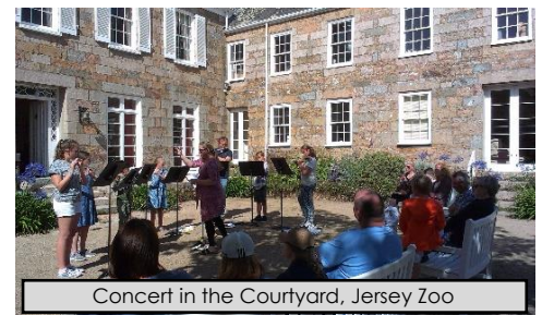
Concert in the Courtyard, Jersey Zoo