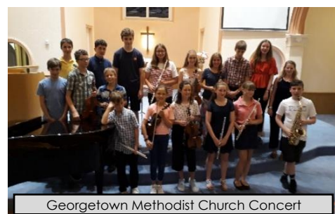
Georgetown Methodist Church Concert