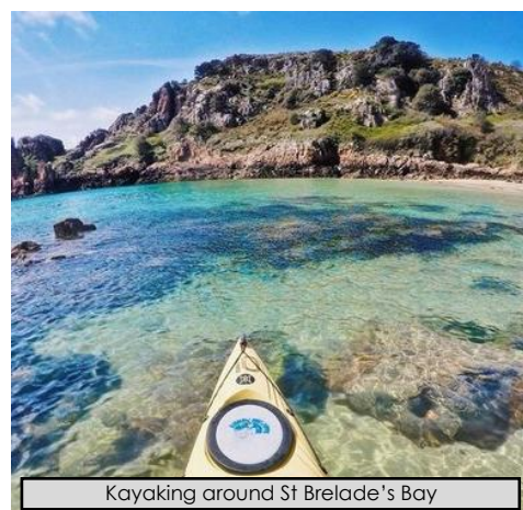
Kayaking around St Brelade's Bay