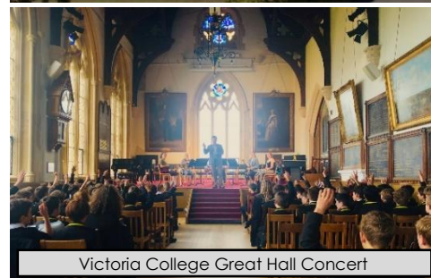
Victoria College Great Hall Concert