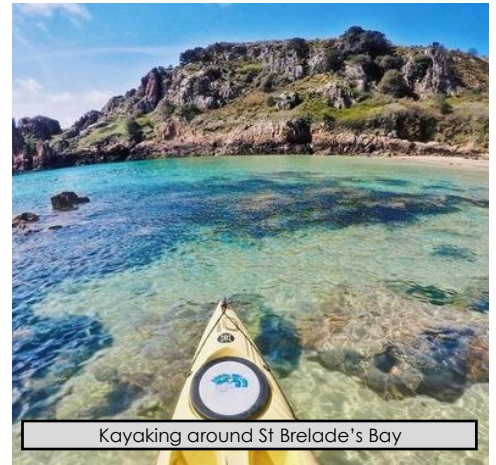
Kayaking around St Brelade's Bay

1900 – Social BBQ Dinner (ie all the local young musicians and visiting young musicians together)