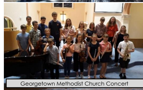
Georgetown Methodist Church Concert