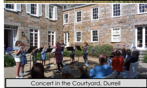
Concert in the Courtyard, Durrell