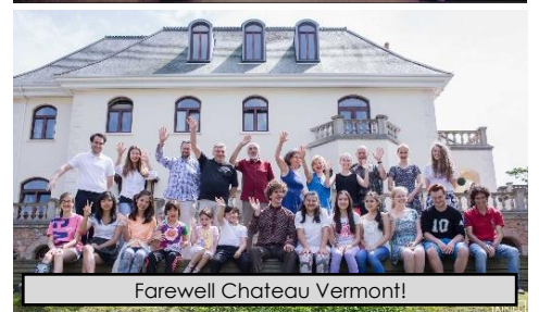
Farewell Chateau Vermont!