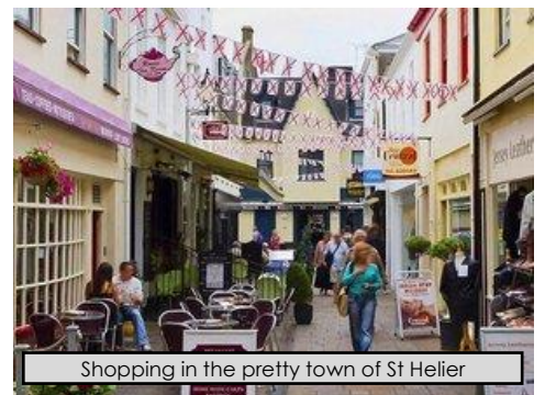
Shopping in the pretty town of St Helier

2130 – Coach to Chateau Vermont, and Post Concert Party for all involved.