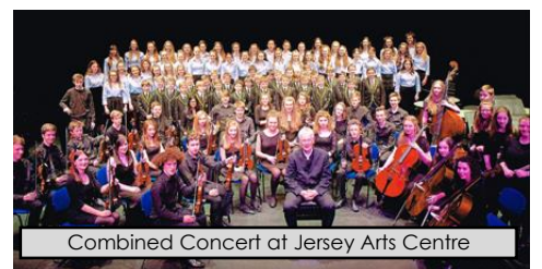
Combined Concert at Jersey Arts Centre