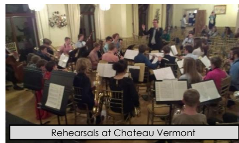
Rehearsals at Chateau Vermont