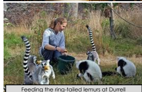
Feeding the ring-tailed lemurs at Durrell