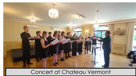
Concert at Chateau Vermont