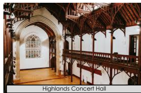
Highlands Concert Hall