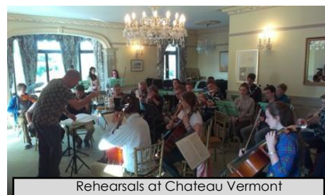
Rehearsals at Chateau Vermont