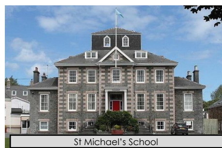
St Michael's School